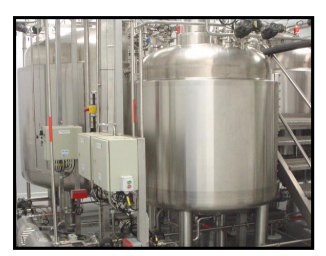
Product Mixing Tanks

After completion of this plant, H+E provided technical and engineering support, together with routine service & maintenance. Our experience is that ultimately such relationships are to the benefit of both parties: Our clients ensure their plants continue to operate at peak efficiency and, with H+E's policy of continuous development,