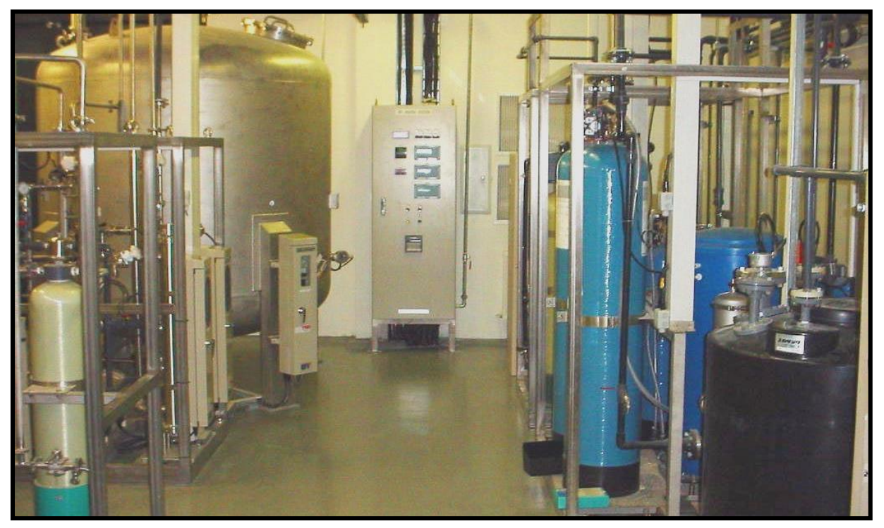
Purified Water Room

H+E have designed, manufactured, installed and validated a range of systems from Purified Water (PW) and Water for Injection (WFI) Systems, to Product Preparation and Filling Systems. These systems were fully validated and satisfied the specified FDA, USP and European Pharmacopoeia guidelines.