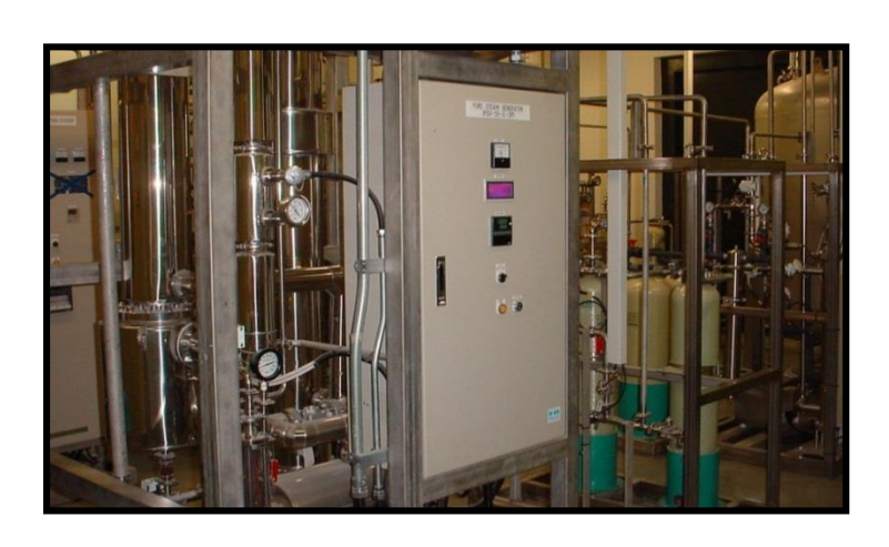
Pure Steam Generator

1E450 Ophtecs Rev 11 Page: 2 Of: 4 Date: 20/04/2016