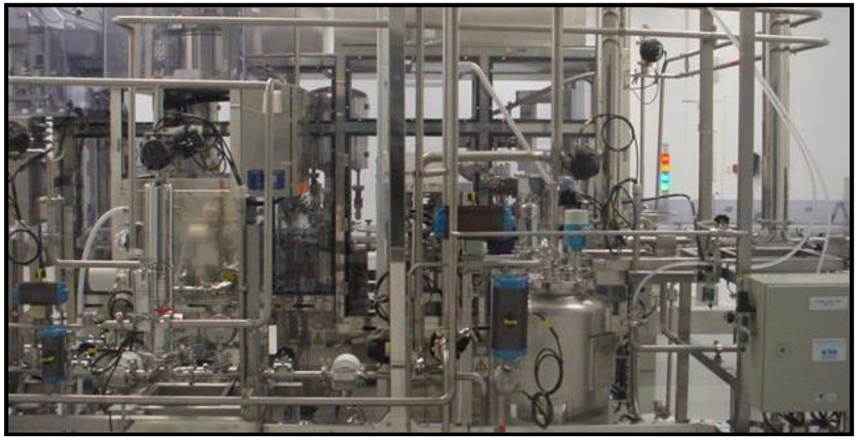
Product Filling Room

High Purity UF System Automatic multi-effect stillWFi storage