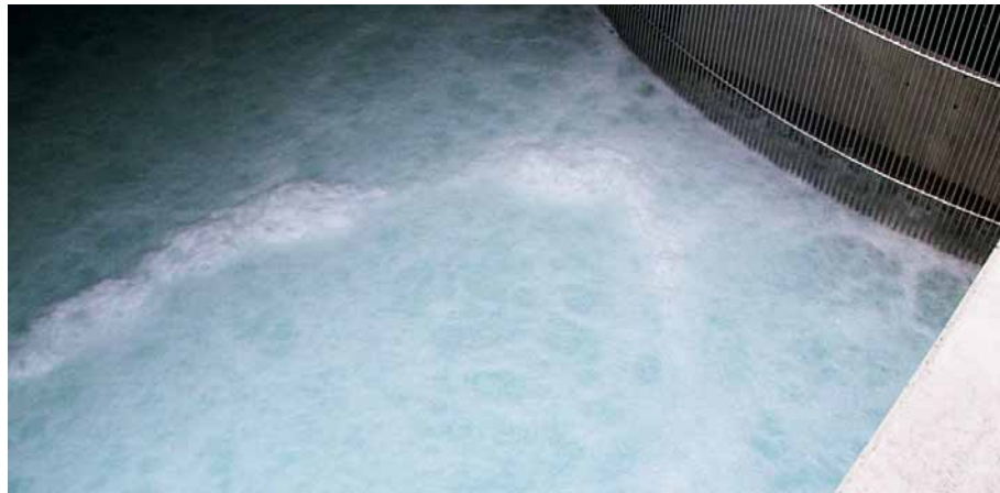
Use of AEROFIT®.V aeration system in the pulp and paper industry to ensure maximum aeration with maximum oxygen transfer.