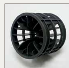
C1 carrier that will be the basis for the biofilm

Lastly, a well-proven restraint grid system secures the carriers within the treatment vessel, thereby ensuring that the biofilm stays in the vessel. This restraint system is designed so that it will not clog during long-term operation.