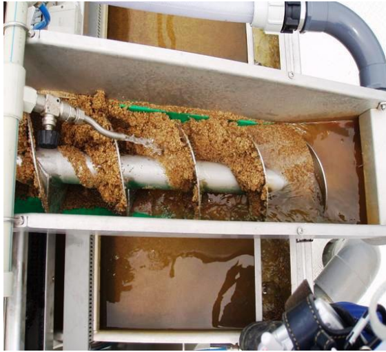
Sand Washer top view showing wash water entering