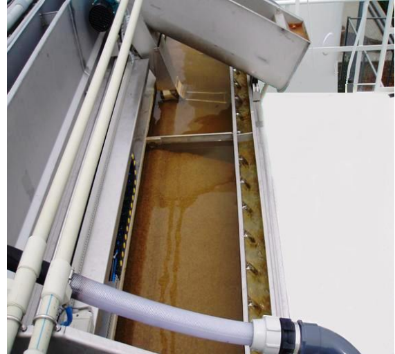
Filter bed top view showing filtered water overflow