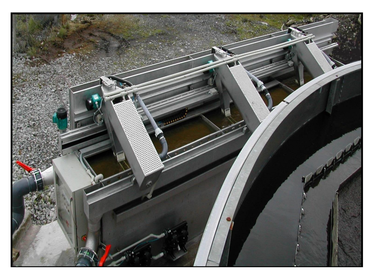
View from above showing the wash water pumps and secondary clarifier

3. The model S-450 filter has a filtration surface area of 4.5m<sup>2</sup> and is designed to handle an incoming flow rate of up to 30m<sup>3</sup>/h at a suspended solids concentration up to 125mg/l. In cases where a lower suspended solids concentration can be guaranteed, a smaller filter can be used.