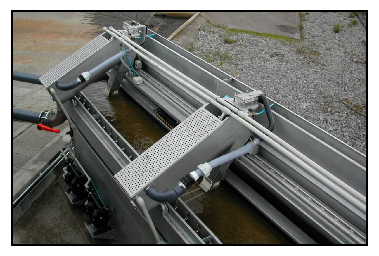
View down into the filter showing two of the sand washers

AIBP is the largest and longest-established beef processor in Ireland, with factories across the country.