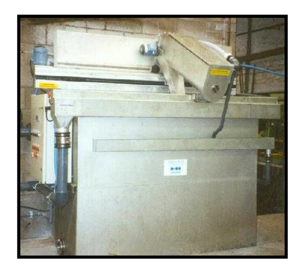
TOVEKO filter is the final treatment step

Bodycote is now one of the UK's largest metal finishing groups, with factories across the country. During 1999, they were informed that the concentration of metals they are permitted to discharge was to be reduced significantly. In common with all responsible companies, Bodycote is determined to be environmentally aware. That said, the fact that it is part of a large group doesn't mean that the factory has a bottomless purse.