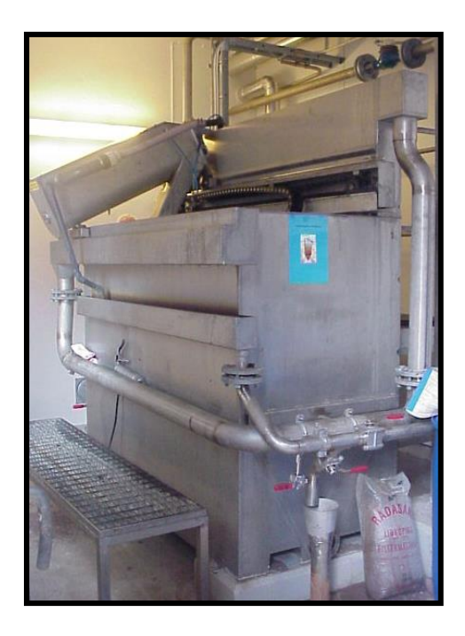
Toveko CX type S-150 in operation at Perstorp Polyon Factory

The main stream flows at over 100 m<sup>3</sup>/h and a side stream has been taken from this and flows through a model S-150 TOVEKO filter. Following first commissioning, it took the TOVEKO filter a while to clean up the whole cooling circuit, but now the entire system runs at a much improved water quality. During the summer period the filter is subjected to disinfection when needed. Other than that there are no chemicals added to the system.