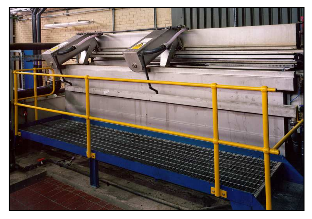
TOVEKO filter installed at Continental. The platform along the front allows convenient access for operators

In order to meet the relatively stringent discharge limits imposed by Welsh Water, the final step in the treatment process is a TOVEKO gravity sand filter. The S-300 model installed normally handles a flow rate of approximately 25 \, \mathrm{m}^3 / \mathrm{h} . However, it can handle 30 \, \mathrm{m}^3 / \mathrm{h} comfortably, giving Continental a valuable safety margin. In common with all companies, Continental need their effluent treatment plant to operate efficiently at all times, and to treat their effluent to well within their discharge consent. This safety margin means that Continental are able to concentrate on their business, rather than on operating the effluent treatment plant.